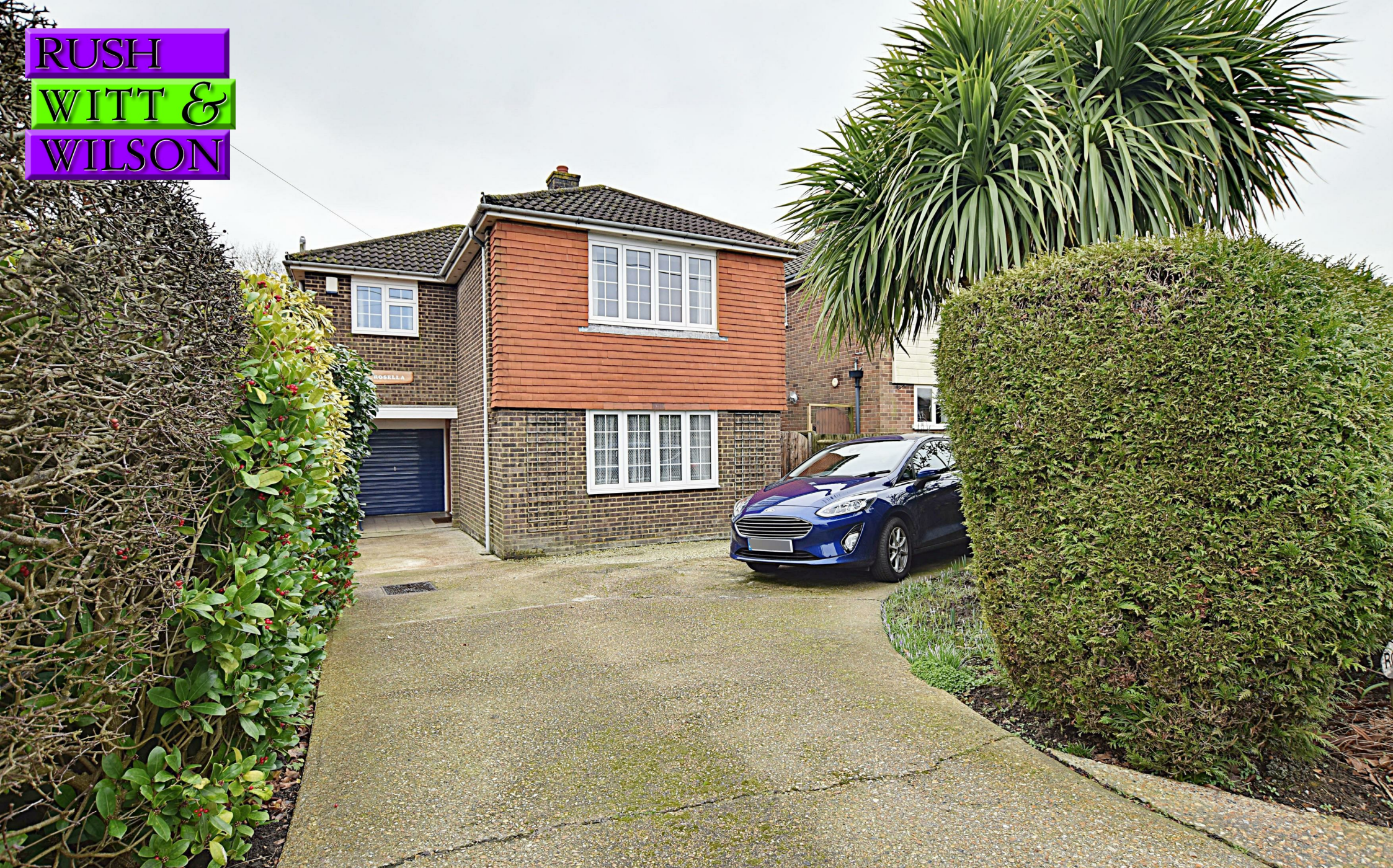
Rosella High Street, Battle, East Sussex TN33 9JP £439,950